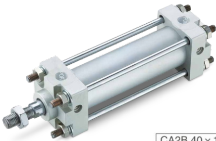
CA2B 40 x 100